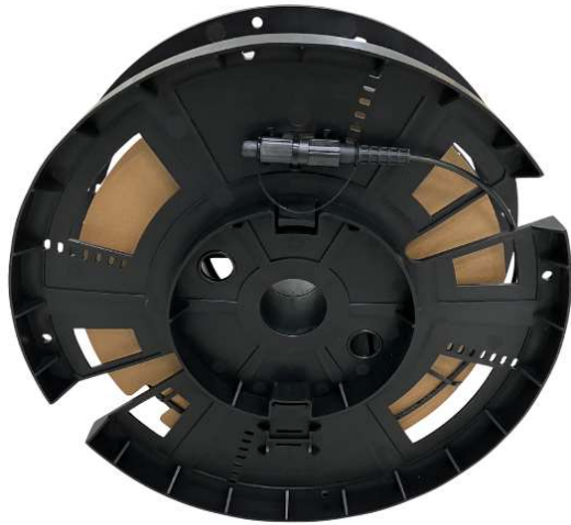
Drop cable sold separately