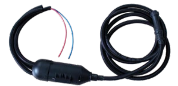
Mobile hybrid drop cable