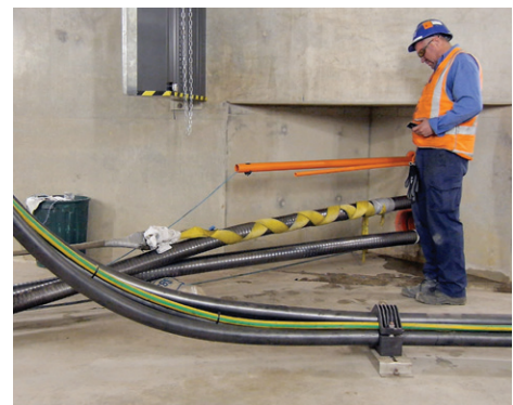
Clockwise from top left: Prysmian 132 kV XLPE cable being prepared for installation; Prysmian 132 kV outdoor terminations to be connected to Ausgrid network; cable installation into existing Ausgrid substation; progressive installation of Prysmian 132 kV cable.